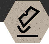
FLOOR- PROTECTIVE DESIGN