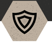
DUAL EDGE- GUARD SYSTEM

PDQ SIZE: 8.8" X 9.125" X 11" PART #: RBMCPDQ QTY: 12 Cutters / Box